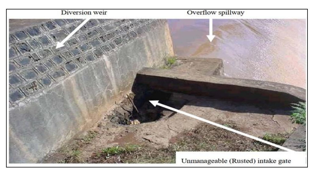
Fig. 1. An intake gate of diversion head work