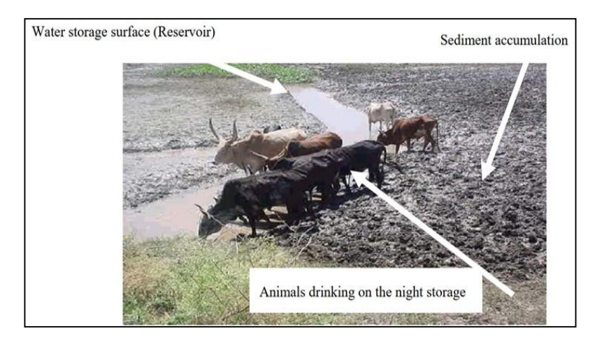
Fig. 2. Night storage of the irrigation scheme

extension service provision. Low awareness of the technology, poor implementation procedures (site selection problems and poor construction management) equally hamper irrigated agriculture [26,40]. Similarly, Bitew [10] reported that the collapsing of many irrigation structures and subsequent leakage cause problems to irrigation practices. When the water level upstream of a structure is higher than the downstream water level and so at this level the water may find another way underneath or along the irrigation structure, or even through a crack in the bottom or sides of the structure to this lower level. Fig. 3 shows that part of the diversion weir that collapsed due to scouring and Fig. 4 shows the leakage on headwork of the irrigation structure and results in water loss and damaging of the weir. This was associated with improper design problem of the irrigation structure.