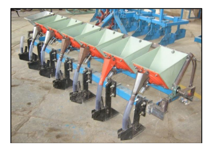
Fig. 3. Complete prototype unit of the seven rows electronic planter

Mansuriya et al.; Int. J. Plant Soil Sci., vol. 36, no. 2, pp. 121-128, 2024; Article no.IJPSS, 112166