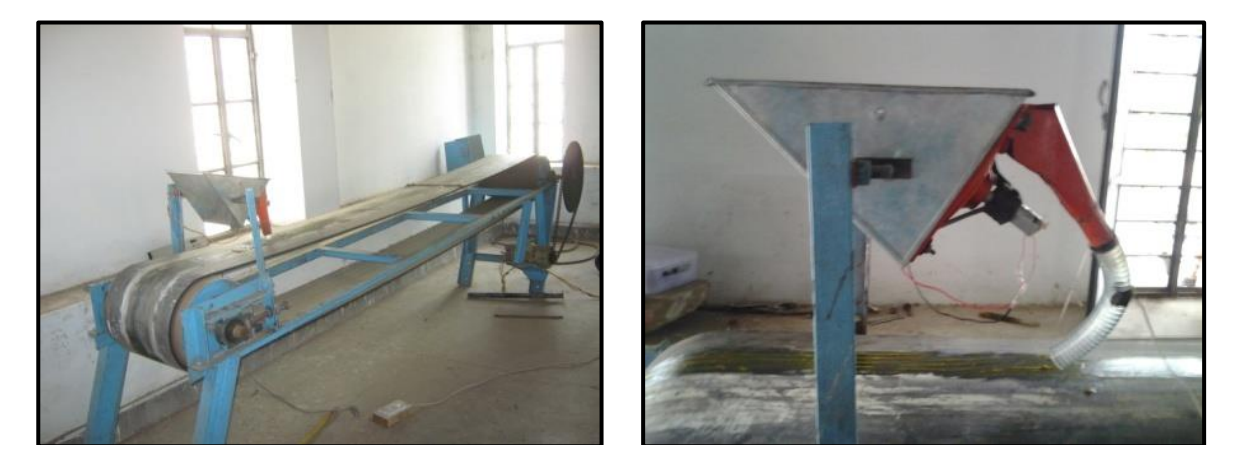
Fig. 2. Grease belt setup with opto- electronic sensor mounted on metering unit for laboratory testing