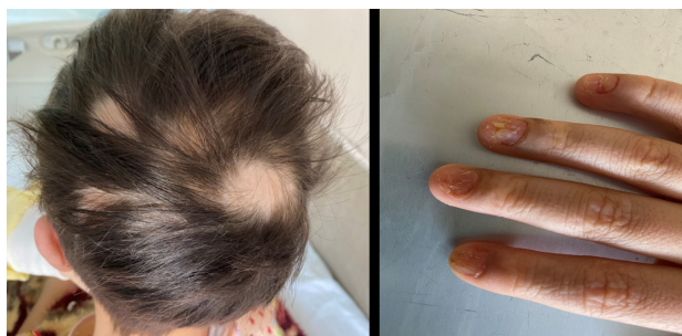
Figure 2. Alopecia areata, nail changes and finger hypopigmented spots.