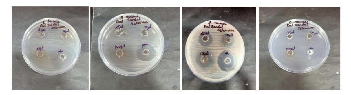
Fig. 2. Image showing the Zone of Inhibition of P.santa mediated selenium nanoparticle