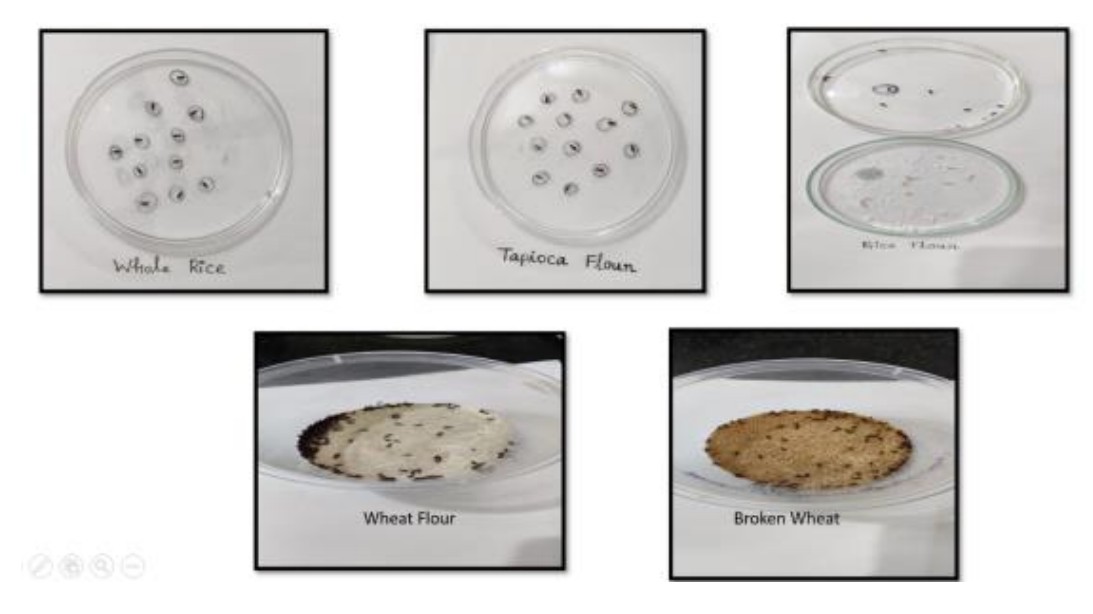
Fig. 2. Red flour beetles from different hosts