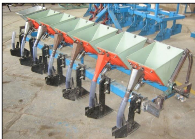
Fig. 3. Complete prototype unit of the seven rows electronic planter