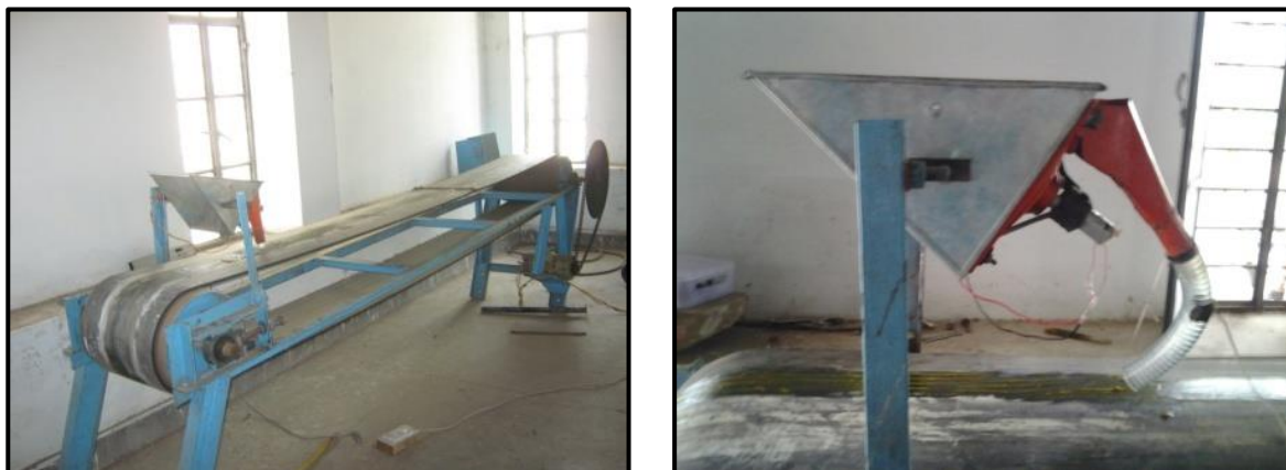
Fig. 2. Grease belt setup with opto- electronic sensor mounted on metering unit for laboratory testing